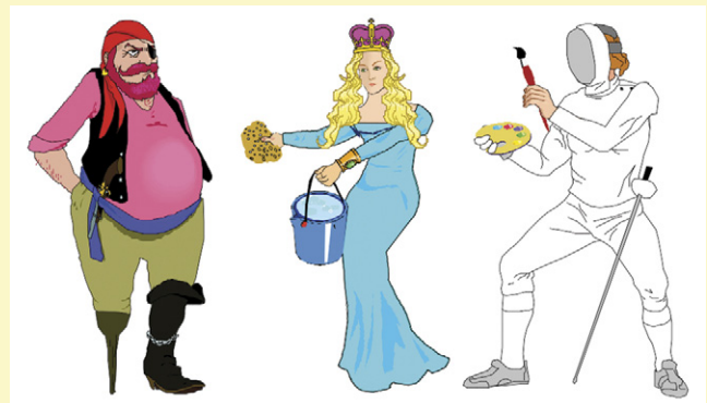
Figure 1. Example of the pictures used in Ref. [54] (a princess washing a pirate and a fencer painting a princess). On hearing 'the princess washes apparently...' (in German), participants tended to look at the pirate. Reproduced, with permission, from Ref. [54].

Several studies have tracked eye movements of participants who listened to sentences while viewing arrays of objects or depictions of events. Participants tended to start looking at edible objects more than at inedible objects when hearing 'the man ate the' (but did not do so when 'ate' was replaced with 'moved') [49]. These predictive eye movements depend on the meaning of the whole context, not just the meaning (or lexical associates) of the verb [50]. Visual information is integrated with prosody [51], grammatical case-marking [52], and discourse context [53] to drive predictive eye movements. In another study, participants listened to 'the princess washes apparently the pirate' (in German) while viewing a picture of a princess washing a pirate and a fencer painting the princess (Figure 1 in this box). Participants tended to look at the pirate before hearing 'pirate', thereby indicating that they predicted the event (i.e. the princess washing the pirate) [54].